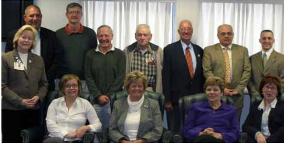
(Cecil County Breeders' Fair Board July 2009 – June 2010)

The Fair Hill Races is organized and operationally supported by the Cecil County Breeders' Fair, Inc. This not-for-profit volunteer board is comprised of members of the community, representatives from the Department of Natural Resources and Union Hospital.