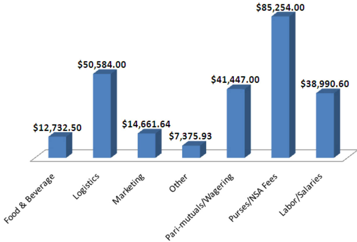
2010 Fair Hill Races Expenses Paid by Union Hospital

Despite the wagering opportunity, Union Hospital derives a very small financial benefit from conducting the Fair Hill Races. The operational costs to run the 2010 Races totaled $251,045.67 , and this year's revenue was $267,584 . Despite a small return on investment, the Foundation and Cecil County Breeders' Fair continue the tradition of steeplechase racing at Fair Hill for the pleasure and enjoyment of all. The 2010 Fair Hill Races raised a total of $16,538.33 that will be used for the Union Hospital Cancer Center.