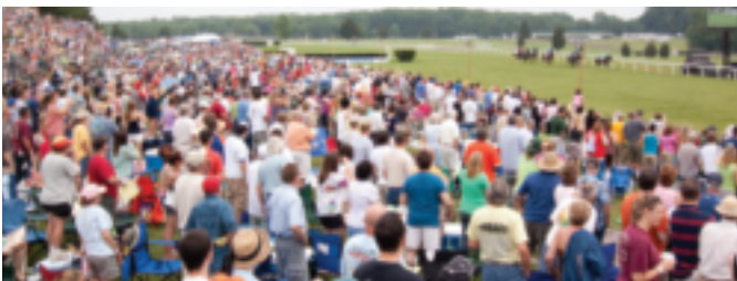
Fair Hill Race