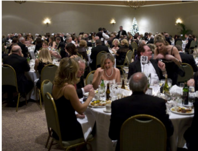
Guests enjoy a four course meal in the grand ballroom of the DoubleTree Hotel.