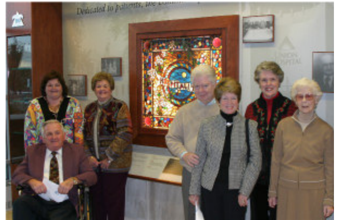
Members of the Warburton family attend the tribute wall dedication ceremony.

On November 21, 2008, the Union Hospital Foundation was proud to unveil the Union Hospital Tribute Wall, a permanent display located in Union Hospital's main lobby. Celebrating a century of Union Hospital's history, the Wall includes a major events timeline and notable hospital artifacts.